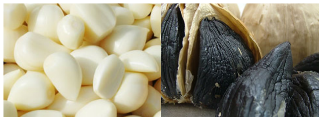
Fig. 1 Processed black garlic clove. Fresh white garlic (left) changed its color to black (right) by processing in a temperature- and humidity-controlled room for a month.